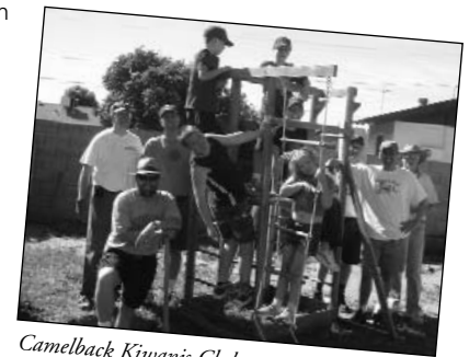
Camelback Kiwanis Club members, with their families, prepare to install the swing set.