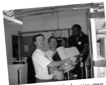
Reorganizing one of the donation areas helped make room for additional items.