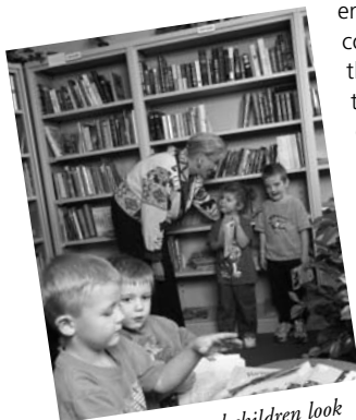
Homeward Bound children look forward to time in the library.

Homeward Bound children look forward to seeing "The Library is Open" sign outside the Marian E. Rowlands Memorial Library. It means they can check out a new book, maybe get some help with their homework, and enjoy an environment that is quiet and comfortable. Our moms also like seeing the "open" sign — it's their opportunity to read with their child or pick up a reference book or magazine.