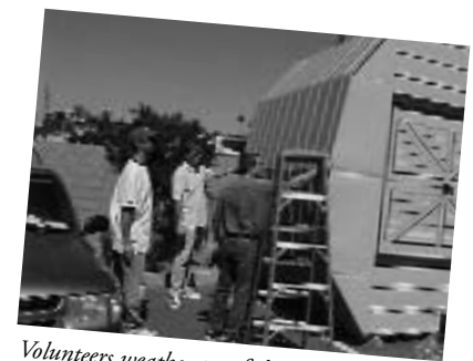
Volunteers weather-proofed an outside storage shed before the monsoon season.

Forty volunteers from Charles Schwab arrived at The Thunderbirds Family Village ready to jump in and do whatever work was needed. The group divided into five teams and headed to their assigned tasks with enthusiasm and vigor. Unlike their normal workday, they shredded old documents, scrubbed walls and counters in the Learning Center, sorted donations, helped build a donations shed, and cleaned windows and doors. Our appreciation to our friends, the Charles Schwab employees, who polished, sorted, hammered, and shredded. Your hard work continues to shine at Homeward Bound. ♦